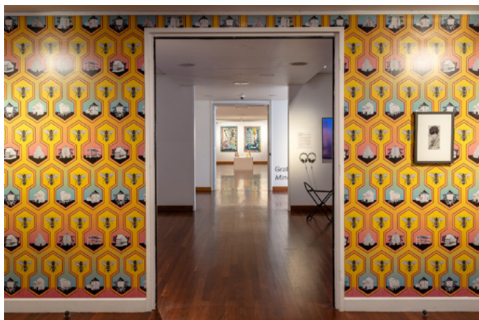
Zanny Begg | These Stories Will be Different , installation view, Shoalhaven Regional Gallery, 2022.

Facility reports, detailing all aspects of the building, staffing, programs and services are required to be lodged with institutions prior to the loan of artworks and objects. See https://mgnsw.org.au/sector/resources/onlineresources/exhibition/facility-reports/