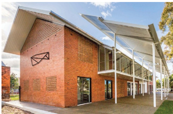
Lismore Regional Gallery

A detailed functional brief, professional knowledge and experience will be necessary at the earliest planning stages. This paper does not attempt to provide solutions or lay down rigid guidelines. Rather, it simply identifies the various factors that need to be considered during the planning process to create a professionally run public/regional gallery. It also acts as a checklist for further action and debate.