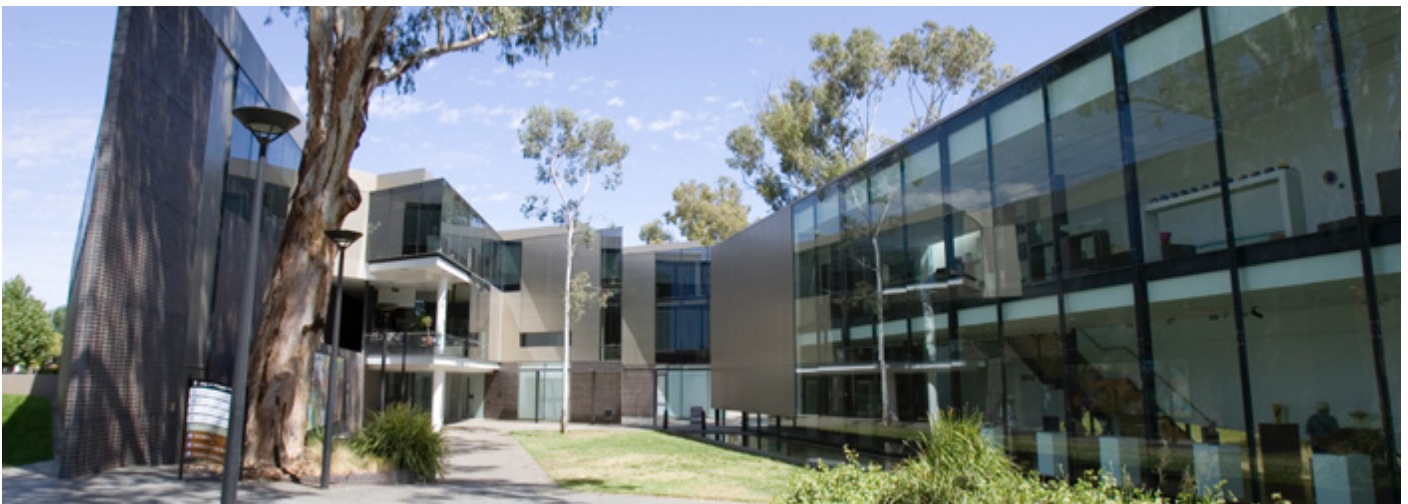
Wagga Wagga Art Gallery

There is also a trend to establish teams of art consultants with architects, retail/commercial experts and gallery staff, together with local government staff, to develop projects. Similarly, these teams are variously employed to deliver feasibility studies, masterplans and business plans to advise on design, fit out, policy, staffing, management processes and programs.