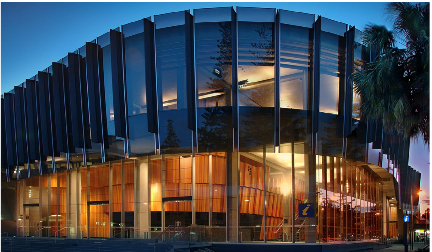
Glasshouse Port Macquarie

For many people, the gallery experience often begins before they reach the building, or on arrival. Careful consideration of branding, foyer and entrance areas, and the positioning of directional signage, placemaking and landscaping elements, such as plants, water features, commissioned public art or gardens, is essential. It is also important that the gallery is visually linked with the surrounding town/land scape and has, and maintains, a strong aesthetic appeal.