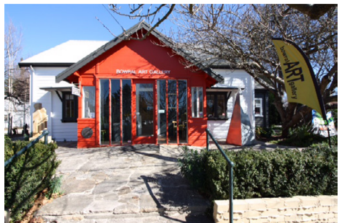
Bowral Art Gallery

In addition to its social and fundraising activities, an effective gallery support group can play a very important role encouraging patronage and community-based volunteer involvement. It's important to note, such groups do not have a formal management role and it is usual for such bodies to donate their fundraising to the institution, generally to support the purchase of art works approved by the gallery director. This group/s of supporters would require a meeting room and access to a kitchen area for catering (if there is a café, function catering would be negotiated with the operator).