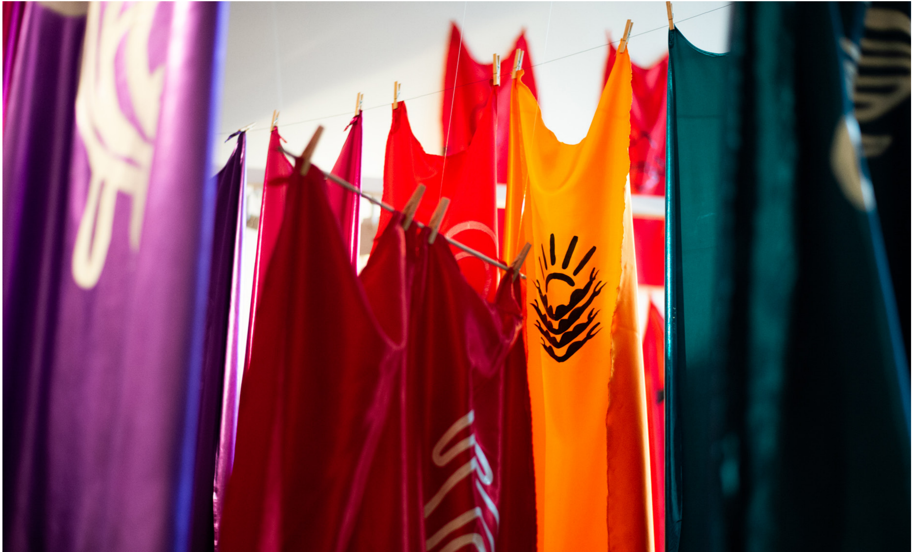
Dennis Golding, POWER [detail], 2021, Blacktown Arts. Photograph: Jade D'Amico