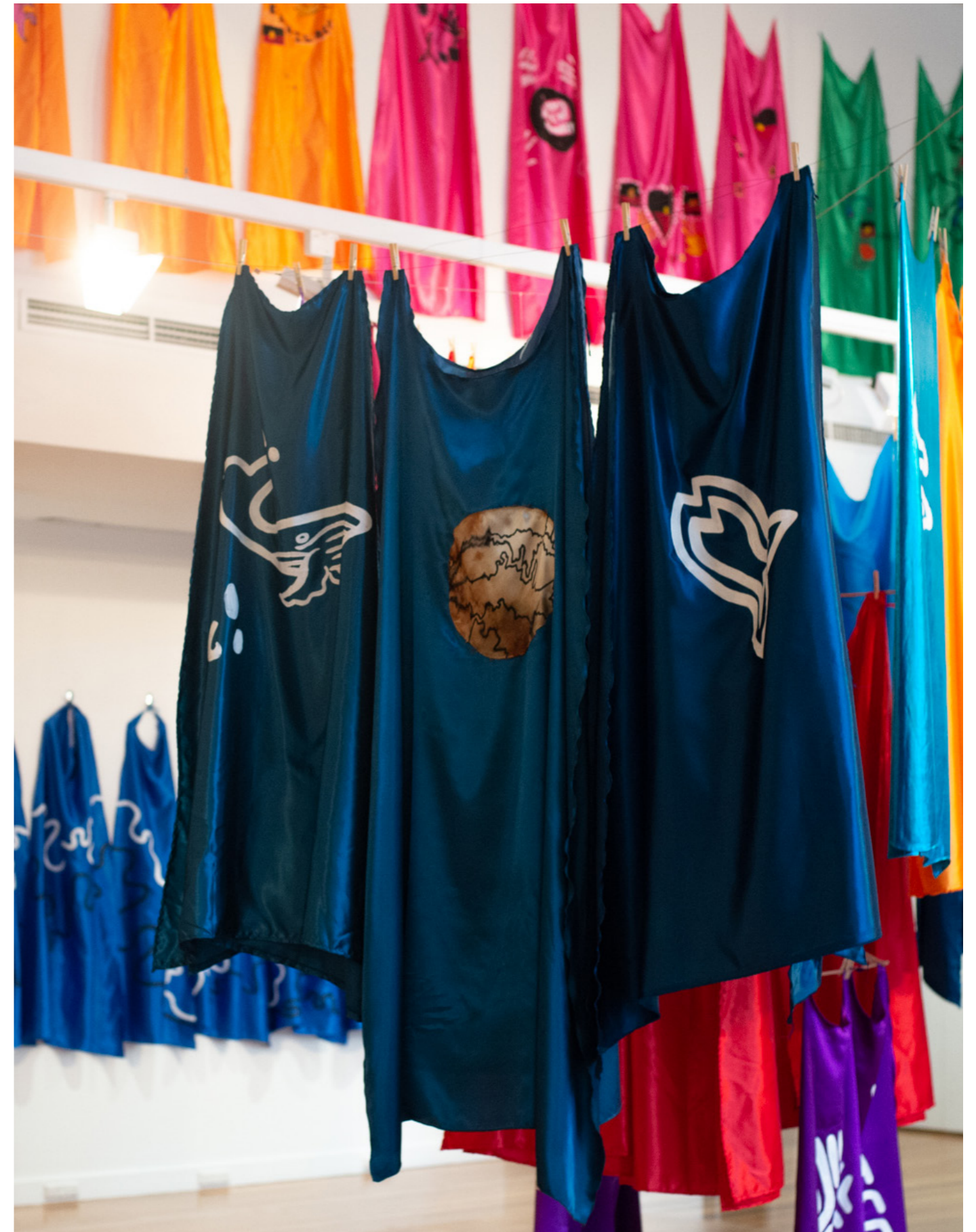
ABOVE: Dennis Golding, POWER [detail], 2021, Blacktown Arts.