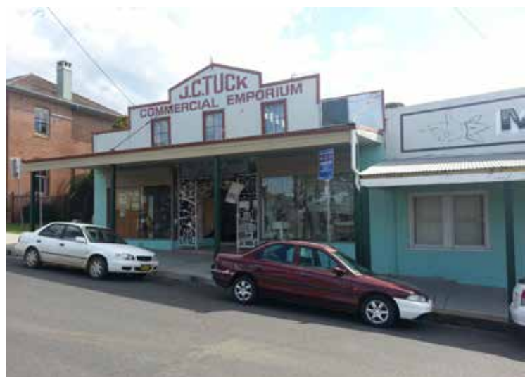
Image: The exterior of the Bowraville Folk Museum.

During the Standards year all the Nambucca Valley museums got together for a meeting that went really well. We're looking forward to working together in the future. We have discussed issues like sharing what is in our collections, which could lead to deaccessioning collection items and distributing them to other museums in the Valley where they will work better.