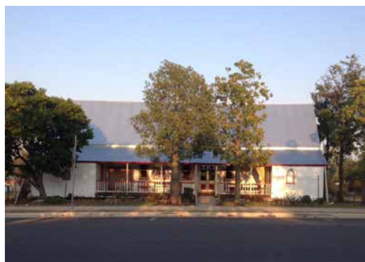
Image: St. Mary's Church built in 1893 – Taroom Museum's main building.

The Standards Review Program has made us more focused on up-to-date documentation and presentation in our museum, including a collection management plan, updating our acquisition register, better understanding of textile preservation, and the importance of proper care and display techniques.