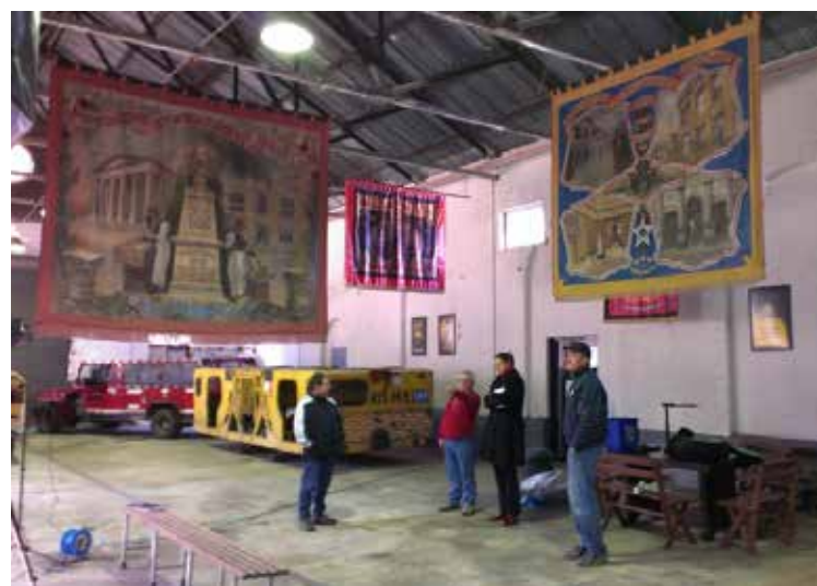
Image: The Bathhouse features a collection of impressive trade union banners. This space is also used for hired functions and special events.

We have particularly focused on improving collection storage and are now developing a room specifically for the storage of small artefacts.