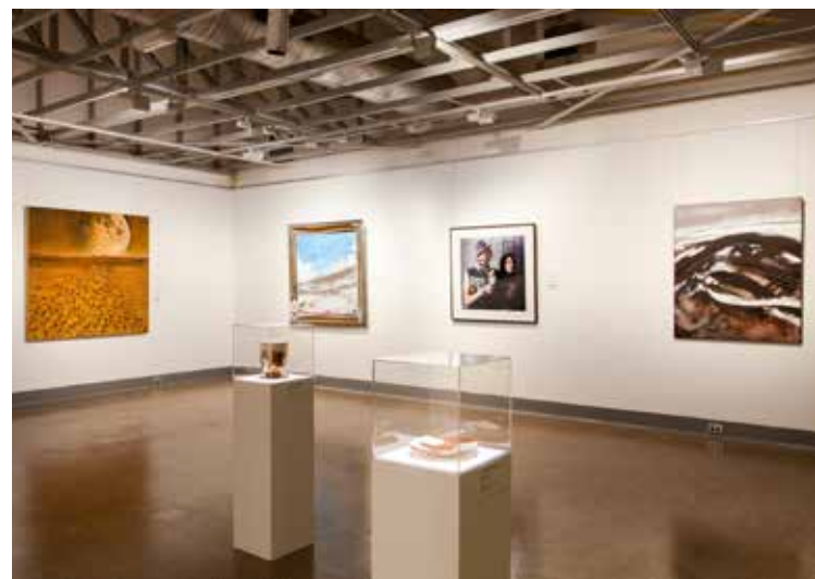
Image: Re-View: Selected works from the Sunshine Coast Art Collection exhibition, Caloundra Regional Gallery.

Working closely with the knowledgeable Reviewers and M&G QLD staff we were not only able to compile a comprehensive list of areas that require development in the future, but also an order of priority and realistic timeframe in which to tackle them.