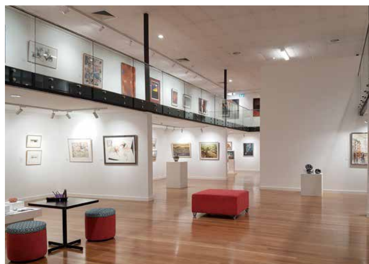
Image: The contemporary gallery setting has evolved from its original use as squash courts.

Advice was generously given on how to involve and maintain engagement with volunteers, participants, audiences, other galleries and the wider community as well as the value of such engagement to Gallery 107 @ Dalby.