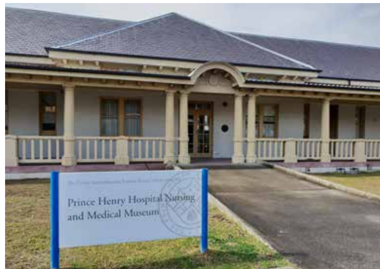
Image: The Prince Henry Hospital Nursing and Medical Museum located within the historic Little Bay precinct.

If you're considering a private visit, or planning a bus or group tour, please contact us as we would be very happy to assist.