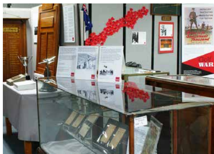
Image: Displays at the Australian Golf Heritage Museum.

The museum offers talks to golf clubs and historical societies and can help golf clubs organise their own hickory golf day. Advice can be provided on collecting, restoring and preserving old or antique golf clubs and other golfing artefacts.