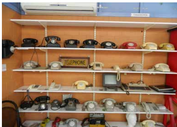
Image: Telephone display at Kempsey Museum.

The call for key documents for Activities 1, 2 and 3, resulted in a reorganisation of our Museum documentation, which has facilitated future Grant Applications. We now also have better documentation for volunteer training.