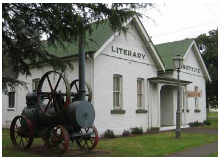
One of the museum buildings.

Our involvement with Museums and Galleries has prompted the move to make our history accessible to a much wider audience.