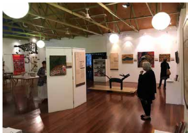
Image: From Our Place: an exhibition from NSW Aboriginal Cultural Centres installation shot.

The Standards Program helps any museum/gallery understand their collection and supports the development of its potential within its cultural context. This program had the flexibility to assist us in our collection management in a fashion that reflected the vision of our Elders and community.