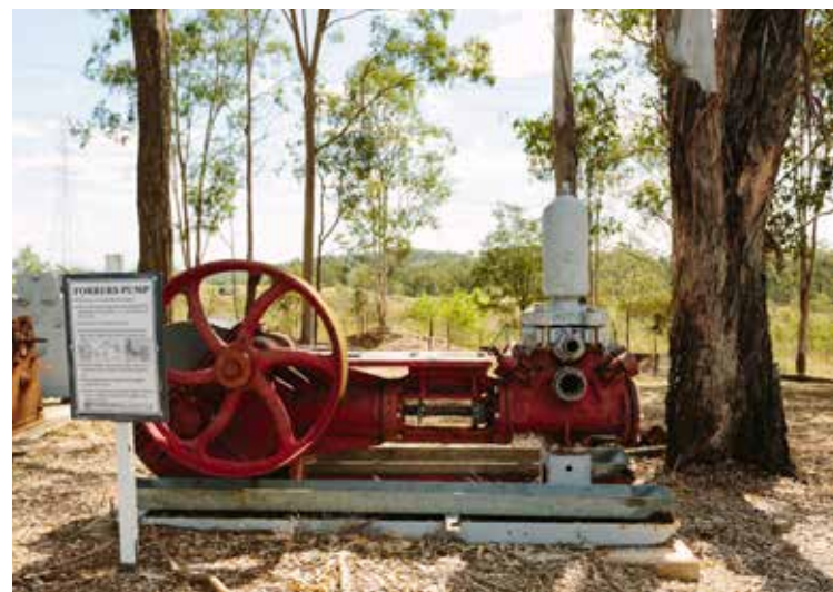
Image: 4x8 model Forrers Pump made in Wharf Street, Ipswich and used in coal mines until 1954.

The Standards Review Program Reviewers have given us excellent advice on how to progress towards a review of our mission statement and collection policy, and development of a disaster preparedness plan.