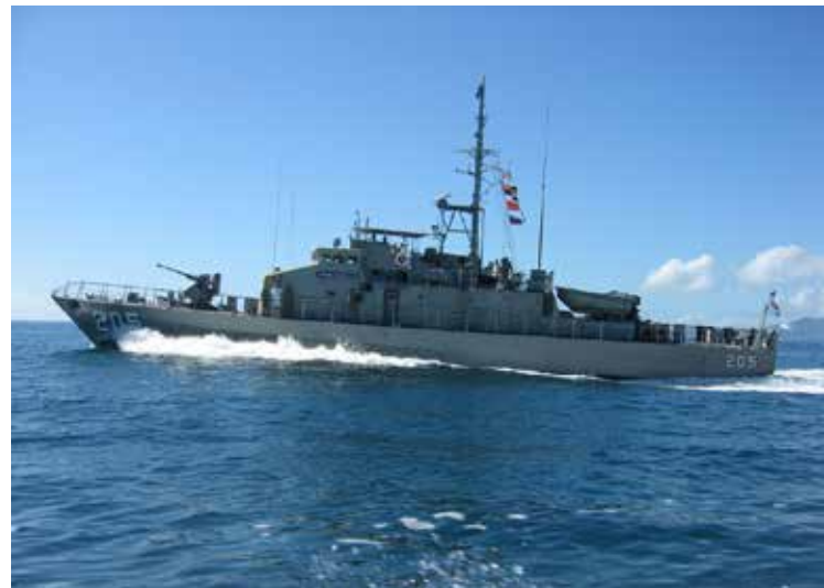
Image: Freemantle Class Patrol Boat, Ex HMAS Townsville

A further outcome of the Standards Review Program has been the preparation of policies and plans for collection management, conservation and public services. These policies were approved by the Board of Directors and are the first of their kind in the history of the Museum. In addition, Work Health Safety policies, procedures and practices have been reviewed and a WHS Manual is now in operation.