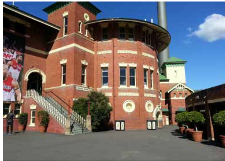
Image: Exterior of the SCg Museum.

Staff have begun writing comprehensive collection documentation process manuals so that volunteers can work in the confidence that all the documentation will be consistent. This is important as the SCG Museum moves to having all its collection available online.