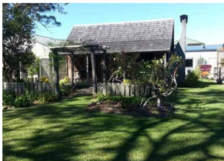
Image: Exterior of Mary Boulton's Pioneer Cottage Museum.

This wheelchair friendly complex is managed by a volunteer committee.