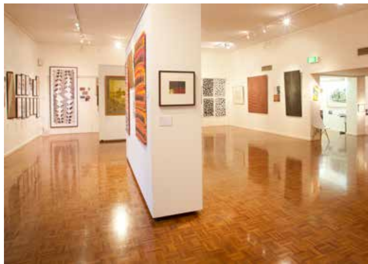
Image: Inside Noosa Regional Gallery.

A recommendation that artworks in council's possession undergo a significance assessment and not be considered a gallery collection, with the large archive of Floating Land digital images to be catalogued and accessioned into the Heritage Library collection.