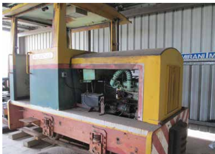
Image: First diesel locomotive used in the sugar industry in the Mackay region.

Discussions with the Reviewers have encouraged us to plan and undertake the process of the digitisation of the collection working in conjunction with the other museums in the Mackay Council region.