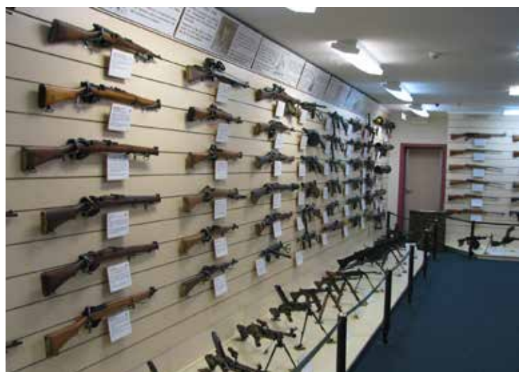
Image: Lithgow Small Arms ground floor gun room

They have successfully pulled out the social history aspects of the factory and are working on telling these stories in an innovative and engaging way.