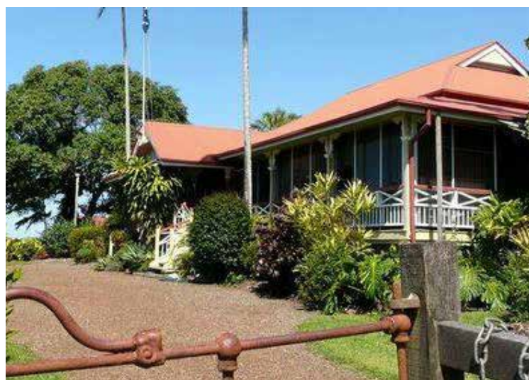
Image: Front view of Mackay's original historic Homestead.

The review program has reinforced our need to become an incorporated body to provide our volunteers and visitors the best experience we can. Through an incorporated body, all volunteer policies and procedures will be reviewed, standardised and agreed by our management committee.