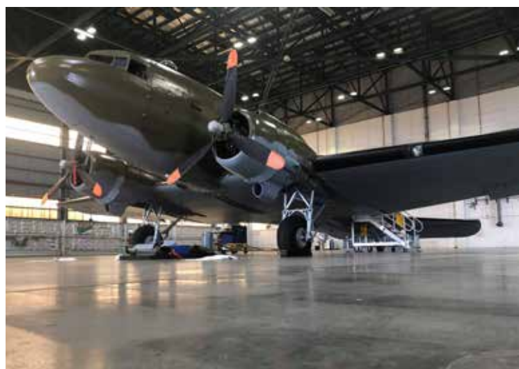
Image: Dakota A65-86.

Advice from the Reviewers helped us to identify the requirement to better capture and analyse our visitor data to help shape and support future development and direction of our exhibitions.