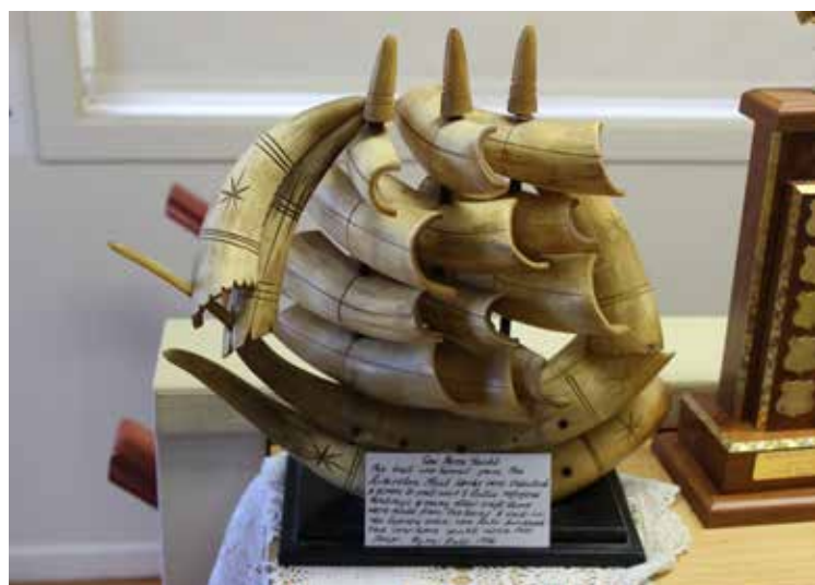
Image: Model yacht made from cow horn at the Nambucca Headland Museum.

The school building in the museum is the old Mission School building and was built in 1916. We have decided to focus on the building for its centenary in 2016. We have also developed a new interpretive panel with a Small Grant and also smartened up the indigenous display.