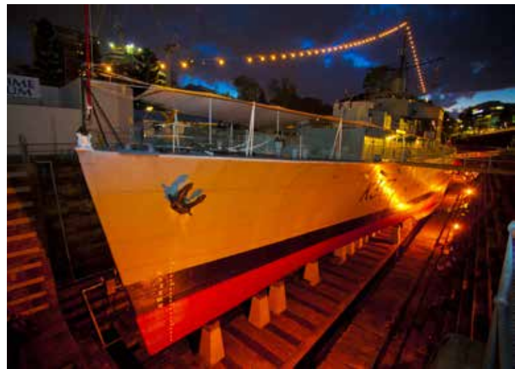
Image: HMAS Diamantina in the South Brisbane dry dock

The program challenged us to reflect more on visitor engagement and how we can improve the visitor experience and the way we tell stories.