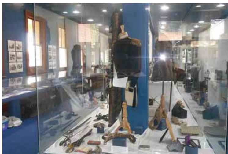
Image: Displays at the Bathurst District Historical Society Museum

There is also a collection of militaria from various theatres of war involving Bathurstians, discrete collections of objects that have been donated to the Society, such as a collection of bird's eggs, and a collection of stuffed and mounted birds, furniture from historic and heritage buildings and properties in the Bathurst district, two scale models of landmark sites in Bathurst, an early X-ray machine developed by a Roman Catholic priest in Bathurst.