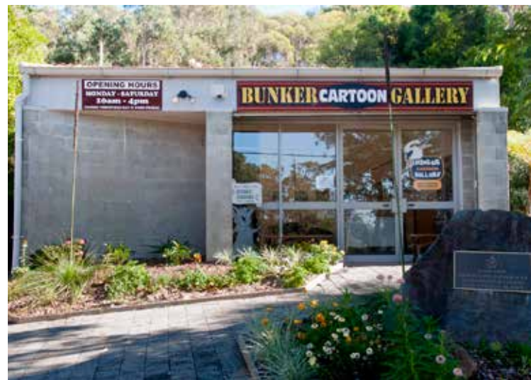
Image: The exterior of the Bunker Cartoon Gallery.

We will also work on establishing the Significance of the collection. A flow on from this would be the emergency evacuation procedures for the collection. We will develop a priority list of which cartoons would be rescued first.