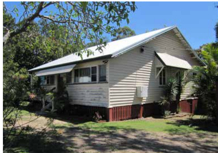
Image: Bli Bli School Residence, 94 Willis Road, Bli Bli.

Our Collections Co-ordinator has produced a list of our holdings as the first step towards accessioning items. As suggested we will keep using eHive, but now as a means to catalogue our collection.