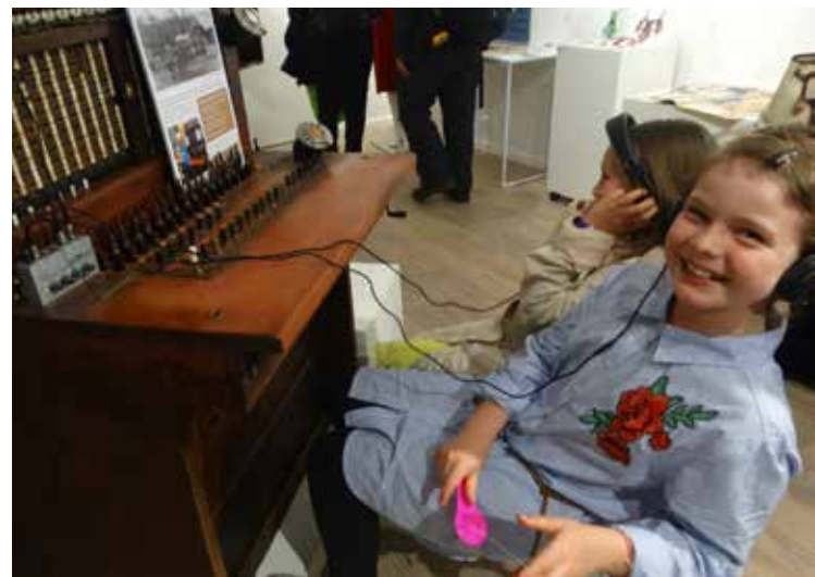
Image: Interactive Eumundi Telephone Exchange.

The Standards Review Program has provided the Discover Eumundi volunteers better insight into the necessity of formal regulations regarding procedures and policies.