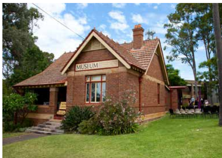
Image: Nowra Museum's historic building, site of the former Nowra Police Station.

Don't procrastinate, just sign up! The extra work involved is more than compensated by the professional advice and unstinting support offered by the museum advisors.