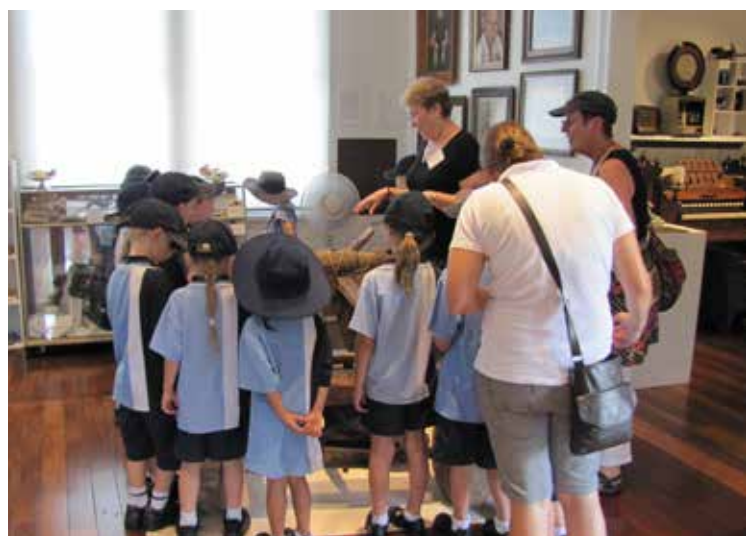
Image: Students fascinated by the "Flintstone Cart", an old goldmining wagon.

The museum is confident in its processes for its future development and prosperity.