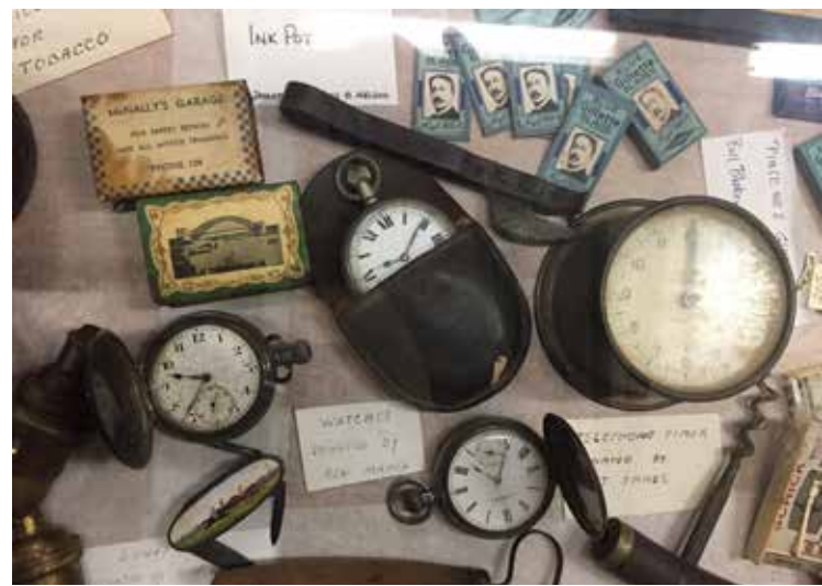
Image: Objects from the Bellingen Museum's collection.