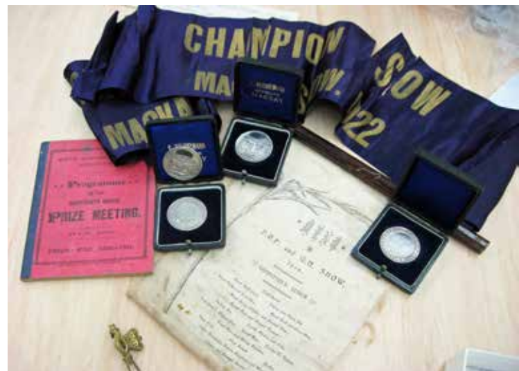
Image: Denman/Fordyce collection objects.

The Standards Review Program allowed Heritage Collection staff to reflect on the amount of work already undertaken; and, provided an opportunity to review current processes to ensure a high standard of collection management and relevance is maintained