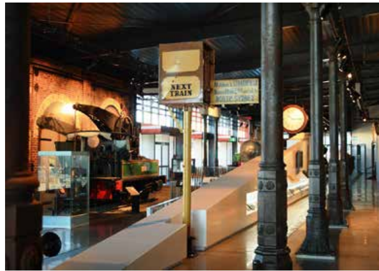
Image: The main exhibition hall of Trainworks.

The curatorial team has started the process of planning for a redevelopment of the displays and an interpretation plan will be developed.