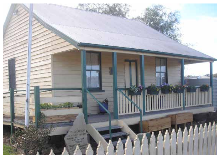
Image: Front view of Jessie's Cottage.

The Standards Review Program has encouraged us to develop a stronger relationship with our local council, particularly considering the important contribution the Cottage makes to the local community and tourism in Lockyer Valley.