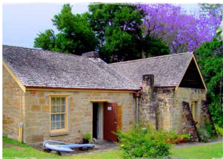
Image: The exterior of Henry Kendall Cottage.

In 2014 we celebrated the 175th anniversary of the building of the Cottage, as well as the birth of Henry Kendall in 1839. Over a thousand visitors attended. The Museum was presented with the Gosford City Council Award for Interpretations Projects and Heritage Events in 2015.