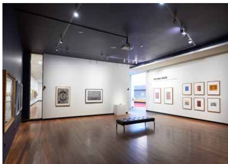
Image: Artspace Mackay's Permanent Collection Gallery features works from the Mackay Regional Council Collection.

We developed an action plan to enable the gallery to re-catalogue all items in the Mackay Regional Council Art Collection. This process will ultimately lead to better quality access for staff, the wider community, and academia to our nationally respected collection. It included a goal to have our collection accessible online.