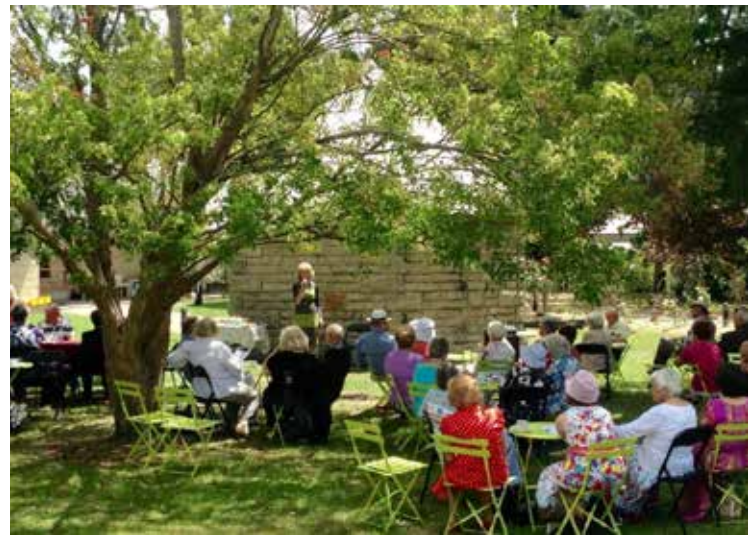
Image: Eskbank garden parties are always a treat.

We are going to implement a new program of volunteer training with bi-monthly meetings, a tour guide training course and regular excursions.