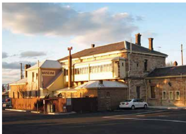
Image: Exterior of the Mt Victoria & District Historical Society Museum.

Having experts look at how you are operating and giving feedback both positive and negative was helpful.