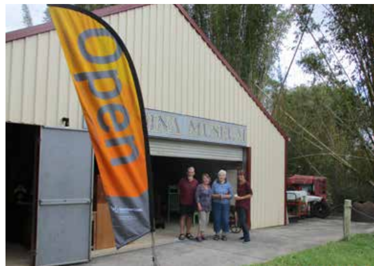
Image: Yandina Museum Credit: Yandina & District Historical Society

Plans are underway to have regular opening hours of the Museum.