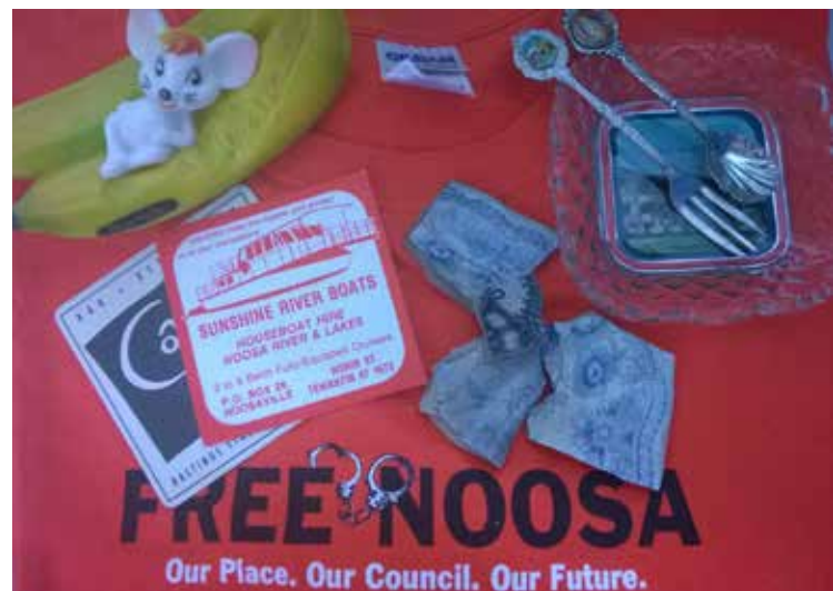
Image: Heritage Library collection items.

Discussions with the Reviewers highlighted the need for the sourcing and implementation of a more robust and streamlined storage system for the Heritage Library's digital collection items.