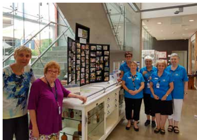
Image: Marble top cabinet – centrepiece of children's ward during 20th century, with museum volunteers.

Participating in the Standards Review Program has enabled us to network with other museums and galleries in the region.