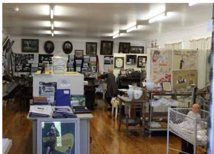
Image: Displays at Don Dorrigo & Guy Fawkes Historical Museum.

The installation of six digital photograph frames to complement exhibitions. A VIM Grant provided funds to purchase metal shelving to install a typological exhibition of domestic items.