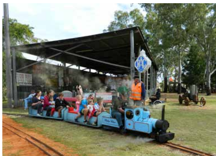
Image: Mini train in the Museum grounds.

Commitment to transfer all hard copy collection records to an electronic system.