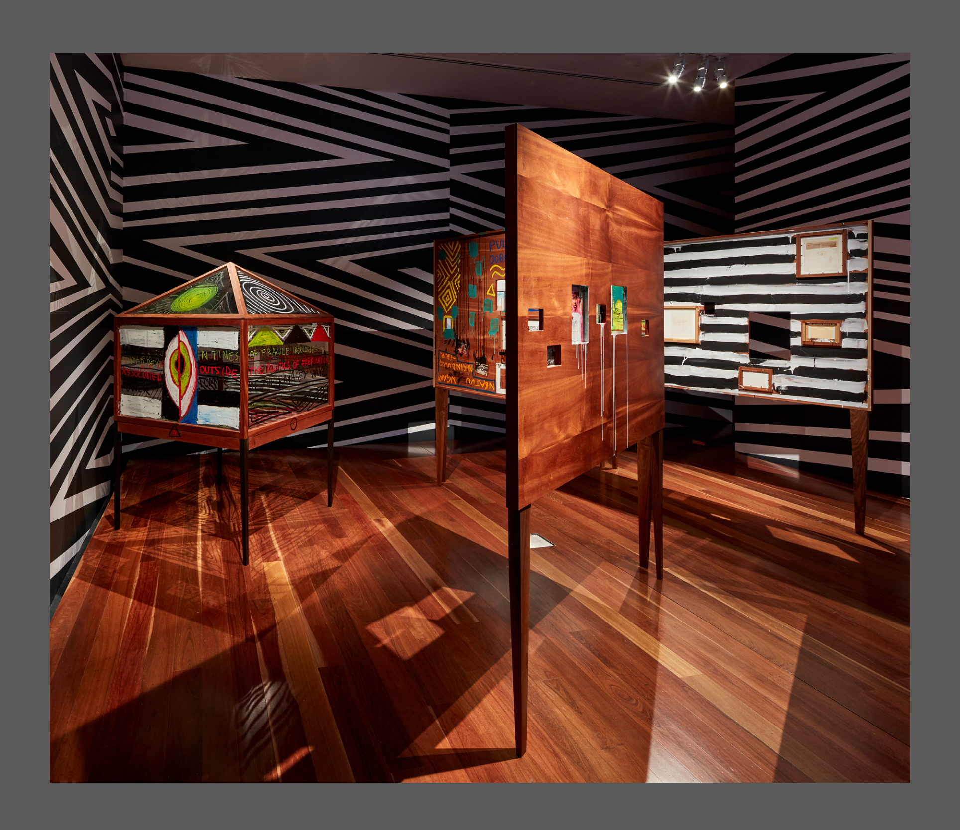
Image: 2019 Adelaide//International, installation view featuring Brook Andrew, Samstag Museum of Art, University of South Australia.