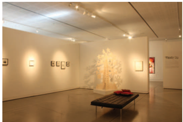
Katherine Simms: What I Wanted To Show You installation view, Regional Art Space 13 November 2010 - 6 February 2011