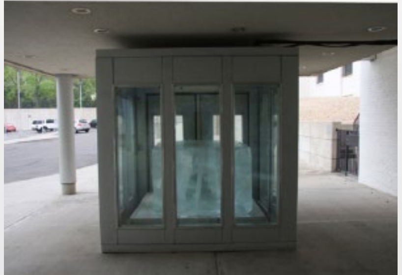
TAVARES STRACHAN ARCTIC ICE PROJECT IN BROOKLYN 2009

IN THIS VIDEO STRACHAN DISCUSSES SEVERAL OF HIS LATER WORKS WHICH INTERSECT BETWEEN ART AND SCIENCE.