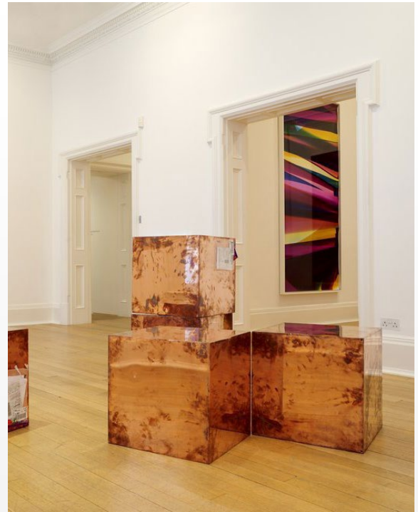
WALEAD BESHTY INSTALLATION VIEW, WALEAD BESHTY: PRODUCTION STILLS, 2009, THOMAS DANE GALLERY, LONDON

BESHTY DISCUSSES HIS EARLIER FedEx WORKS (32 MINS – 35.30MINS) IN THIS VIDEO . DISCUSS THE SIMILARITIES AND THE ADVANCEMENTS MADE BETWEEN THE GLASS AND COPPER BASED FedEx SERIES'.