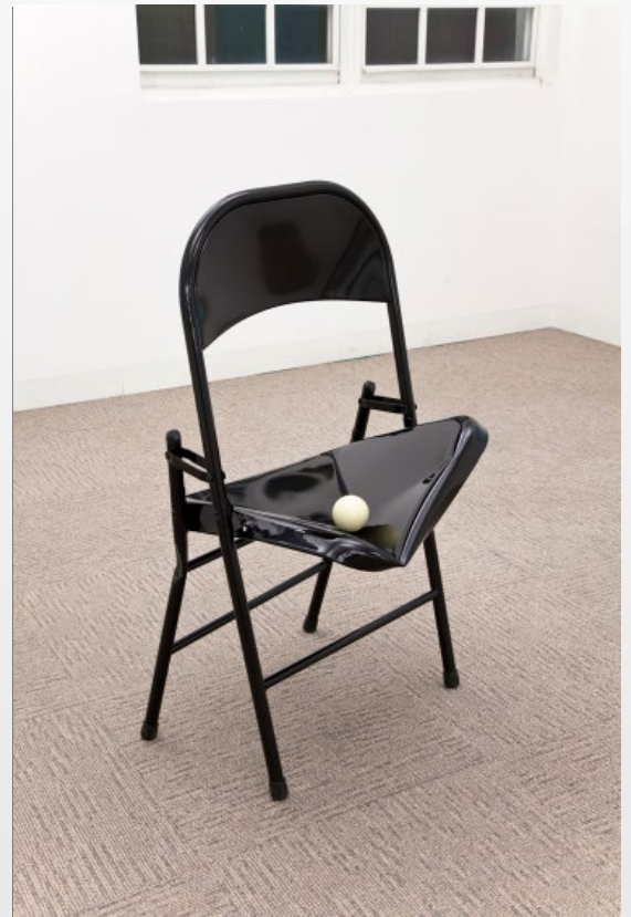
DYLAN LYNCH Gully 2012. THERMOSET RESIN, ENAMEL AND STEEL.

THE STILL HOUSE GROUP IS AN ARTIST RUN SPACE IN NEW YORK, EXPLORE THE EIGHT ARTISTS WHO WORK AND EXHIBIT THERE.