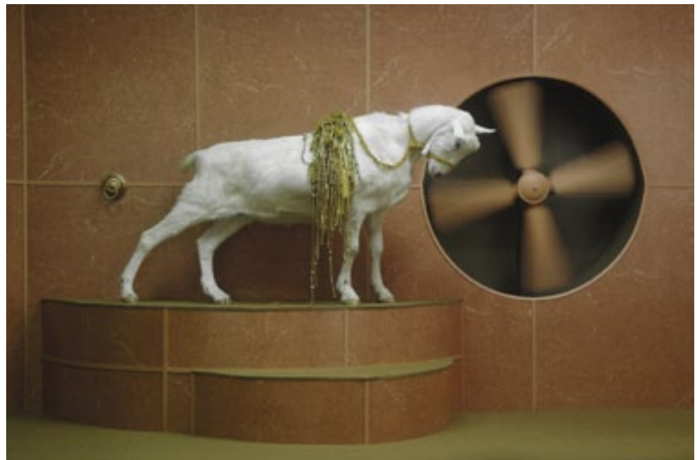
Hayden Fowler Goat Odyssey , 2006, digital video, 16:9 format, sound, colour, single channel, 15:10 loop, 61/70. Collection Rachel Verghis

Newell Harry Beginnings and Endings/Endings and Beginnings , 2008, neon (Helvetica, snow white), 10 x 330 cm, 2/5 + 2 AP.