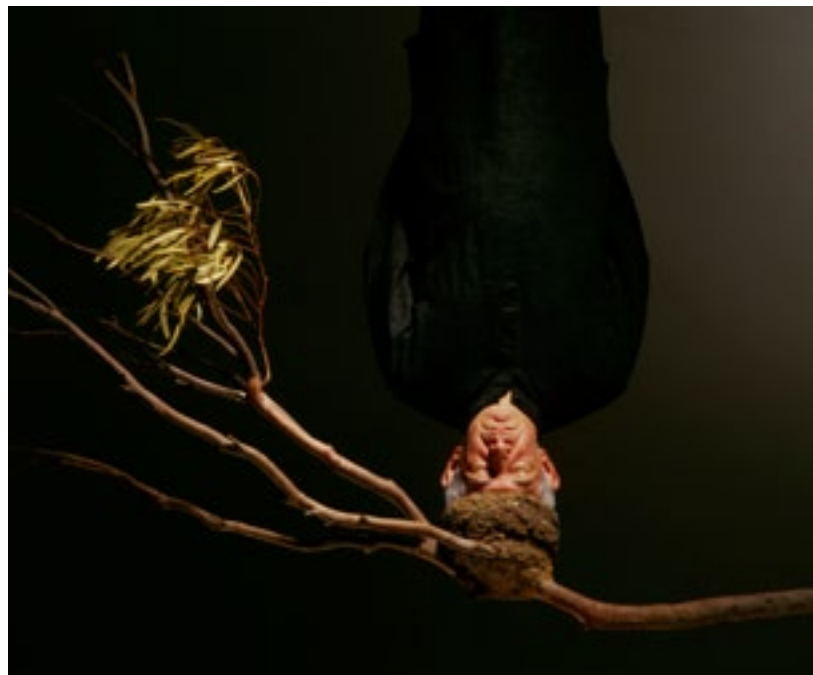
Hossein Valamanesh Nesting , 2005, digital print on watercolour paper, 113.5 x 135 cm, 4/5. Image courtesy the artist and GRANTPIRRIE. Collection Rachel Verghis