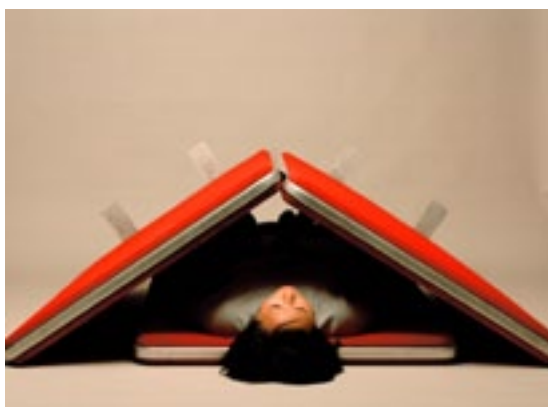
Vanila Netto Little Red Rugged Rocking Roof , 2003-4, digital print on aluminium, 72 x 99cm, 1/5. Collection Rachel Verghis

On each activity page is a Subject Link suggestion panel. These panels list the potential cross subject opportunities presented by each work. It is by no means exhaustive but intended as a base guide. Given the nature of the work exhibited, Photography and Visual Arts subjects are obvious links to all of the focus works.