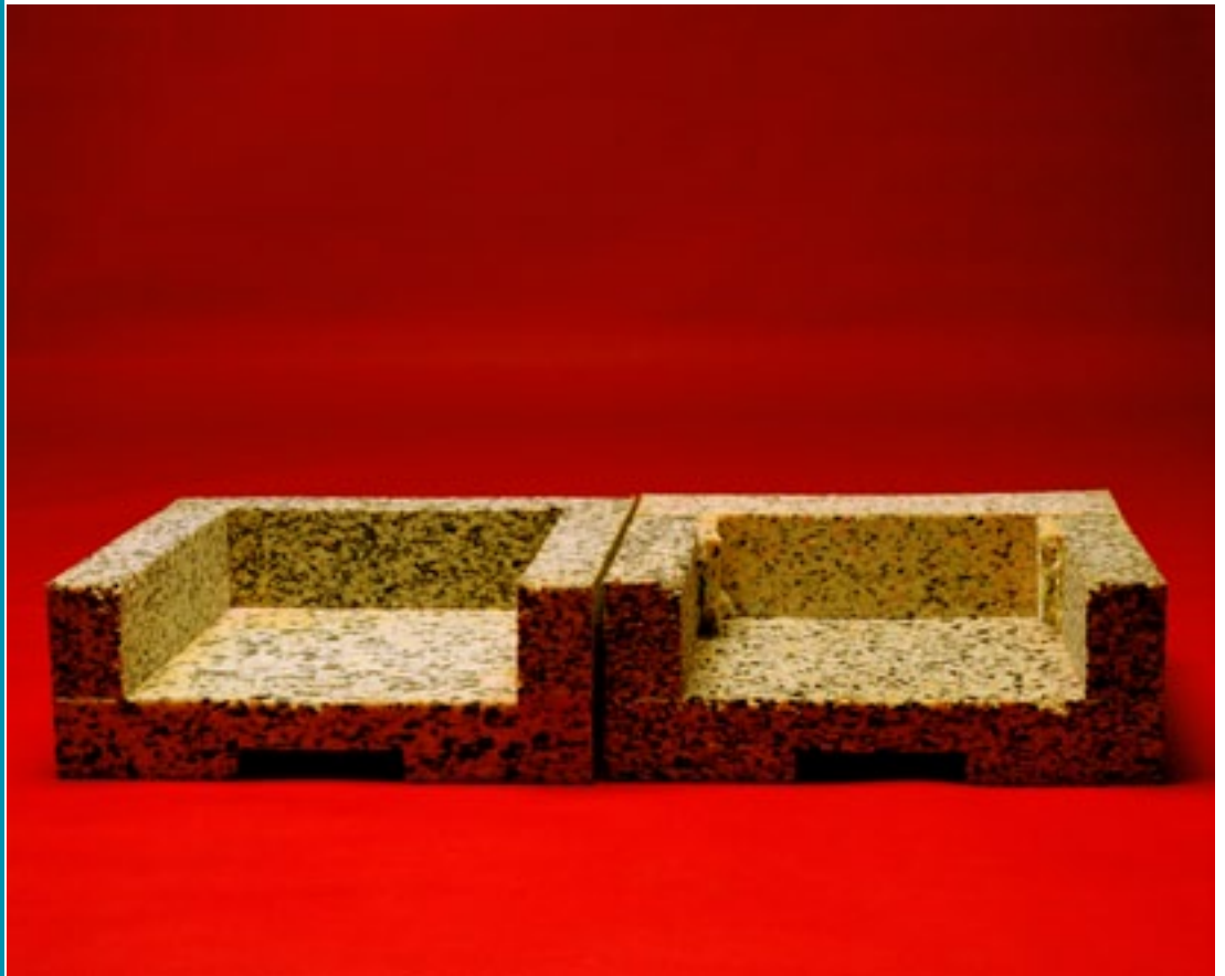
Vanila Netto Mini-Flex Super-Comfort , 2003-4, digital print on aluminium, 75 x 93 cm, 1/5. Collection Rachel Verghis

“I am interested in subverting the symbolic power of goods and utility by making photographs that suggest alternative systems, where modest, underrated sources are invested with unusual functionality and nobility. The human figure and selected discarded objects or materials are reconfigured to emphasise the intense, the unexpected, and the unusual in simple, improvised interventions.”