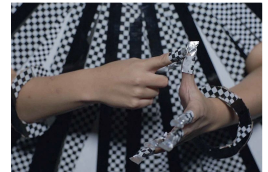
← Assisted performance sculpture Paint, wood, tape, plastic, cardboard, various materials.