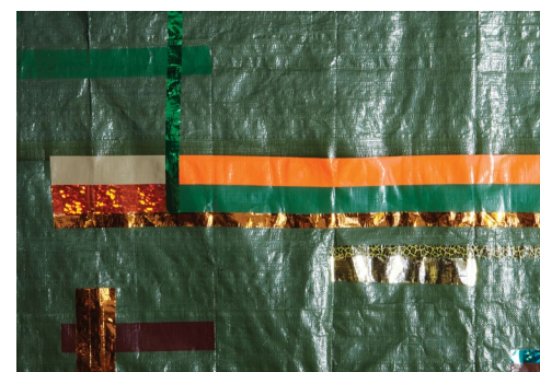
↑ Performance relic painting Tarpaulin, tape, rope.