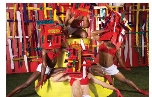
↓ The Joy of Life after Matisse/Madonna/Marcel 3 channel HD video; Matisse , 9 minutes 55 seconds, Madonna , 10 minutes 5 seconds and Marcel , 10 minutes 10 seconds. Tape, foam core, paper, paint, various materials.