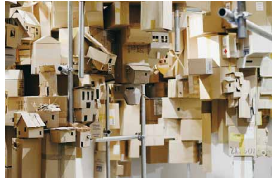
In-Habit: Project Another Country , 2012

A+I: Growing up in a country where people have access to everything is not something that we can compare with. The Badjaos are marginalised people living a very destitute existence in very strained circumstances but what we have observed is happiness as they have a strong sense of community. I cannot say much about Australia as we have been living here only for the past seven years.