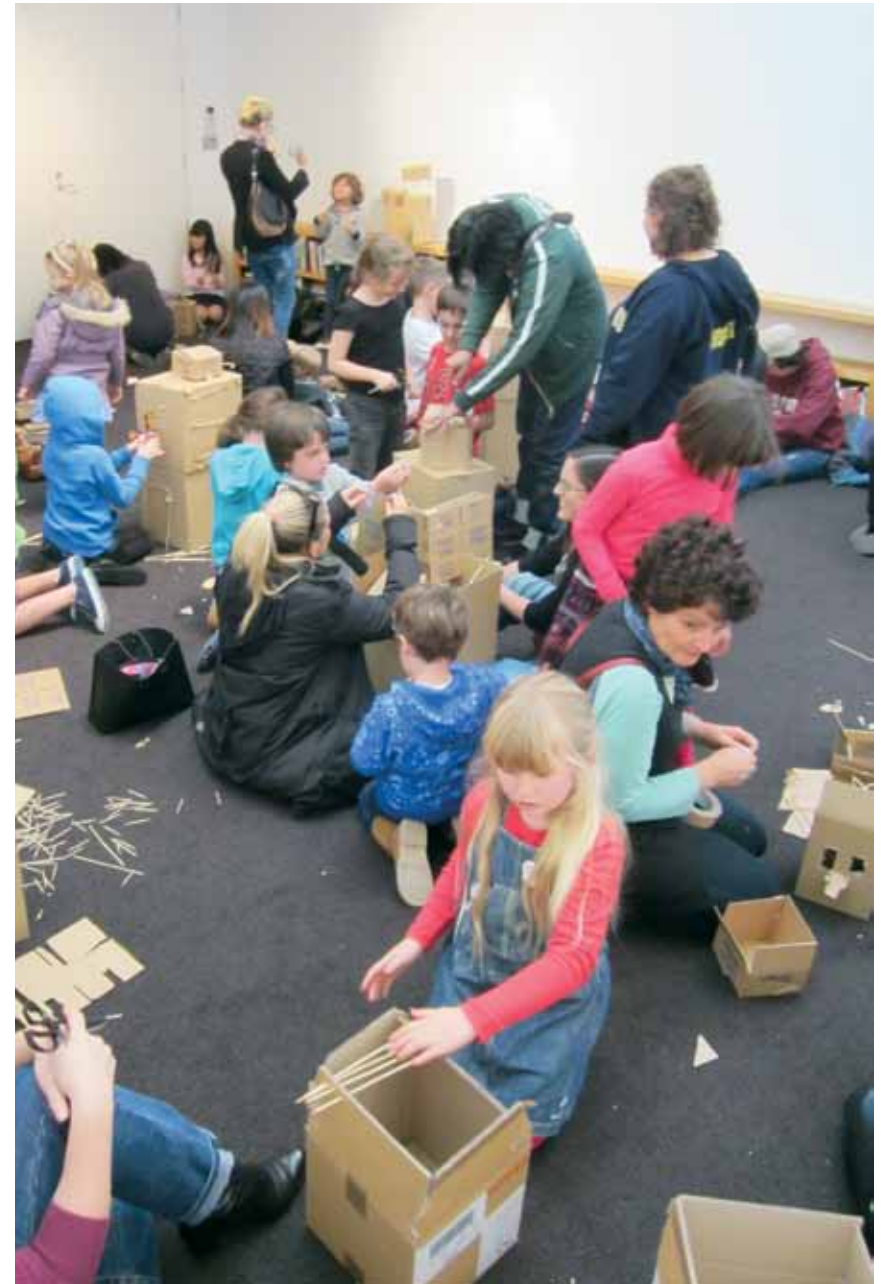
In-Habit: Project Another Country , 2012

In-Habit: Project Another Country encourages storytelling and exchange via these methods of collaboration put in place by the artists. Through collective art making the artists aim to forge new relationships, foster interactivity and generate discussion. The role of the artist as the sole 'maker' or 'author' of the work is subverted by the Aquilizans, who prioritise collective interaction and creative thinking through collaborative art making.