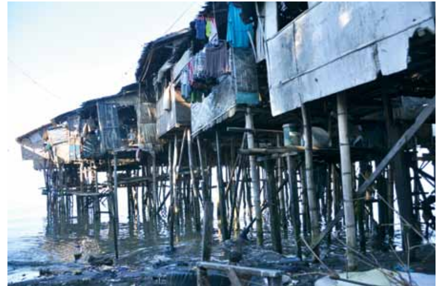
In-Habit: Project Another Country, 2012 Location photographs, BADJAO Community Seaside II, Barangay, Matina Aplaya, Davao City, Philippines. Commissioned by Sherman Contemporary Art Foundation 2012. Image courtesy the artists.

The Badjao were originally sea faring nomads, an indigenous ethnic group of Maritime Southeast Asia, who lived and worked on the sea front. As international boundaries