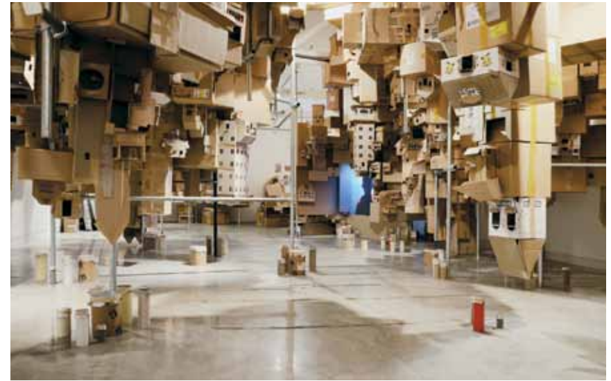
In-Habit: Project Another Country , 2012