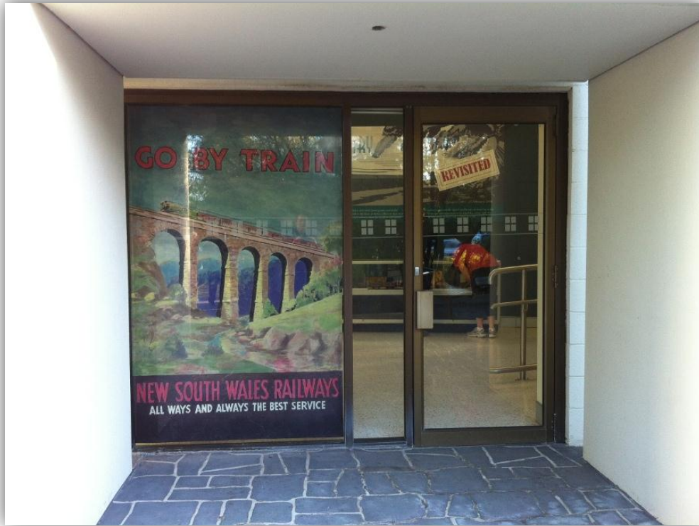
Window poster of the same image – capture once, use many times

Even if we think an image is only to be used as low/web resolution jpeg for web delivery we still create a high resolution master TIFF. If someone places a reading room request for a high quality image – or our boss has another 3am moment – we can provide it without disturbing the original archive.