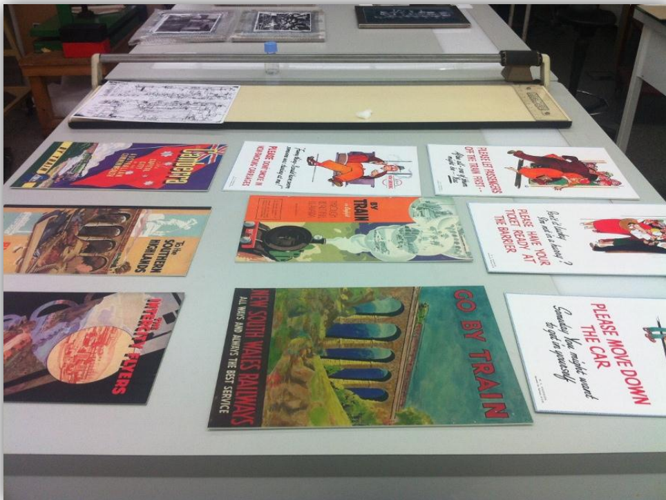
See the poster front and centre?

A while ago we digitised some railway posters and brochures for an exhibition installation at the Western Sydney Records Centre...you remember, the one where our boss woke up at 3am ? The documents were digitised as high res (master) TIFFs. One derivative was generated as a print-quality file to be displayed as a poster in an exhibition case here: